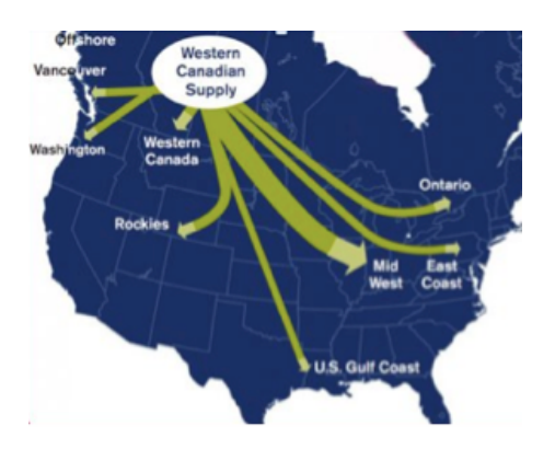
Figure 2 Destinations of Alberta's oil sands to North American markets (Canadian Association of Petroleum Producers 2012)